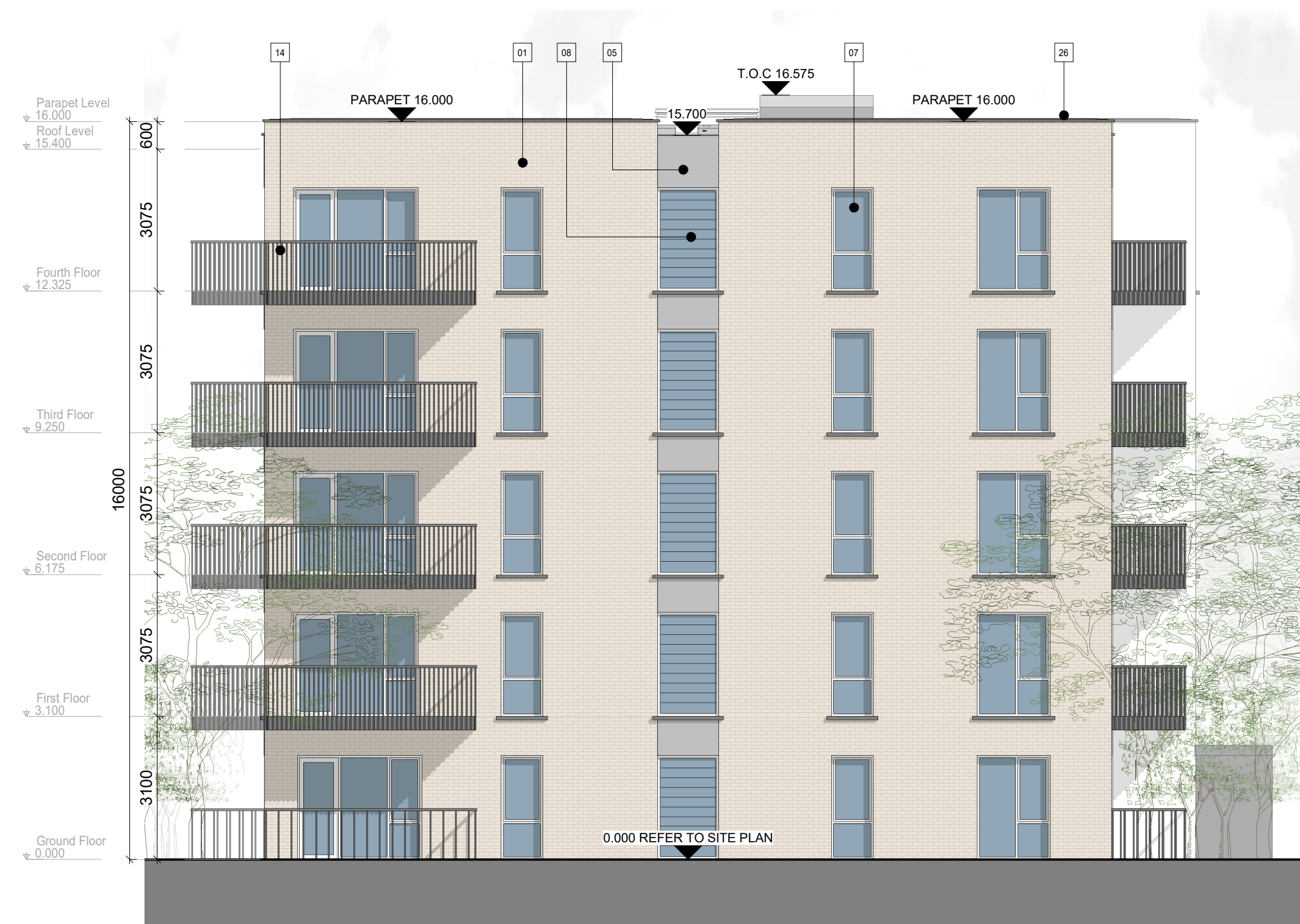
North Elevation SCALE: 1 : 100