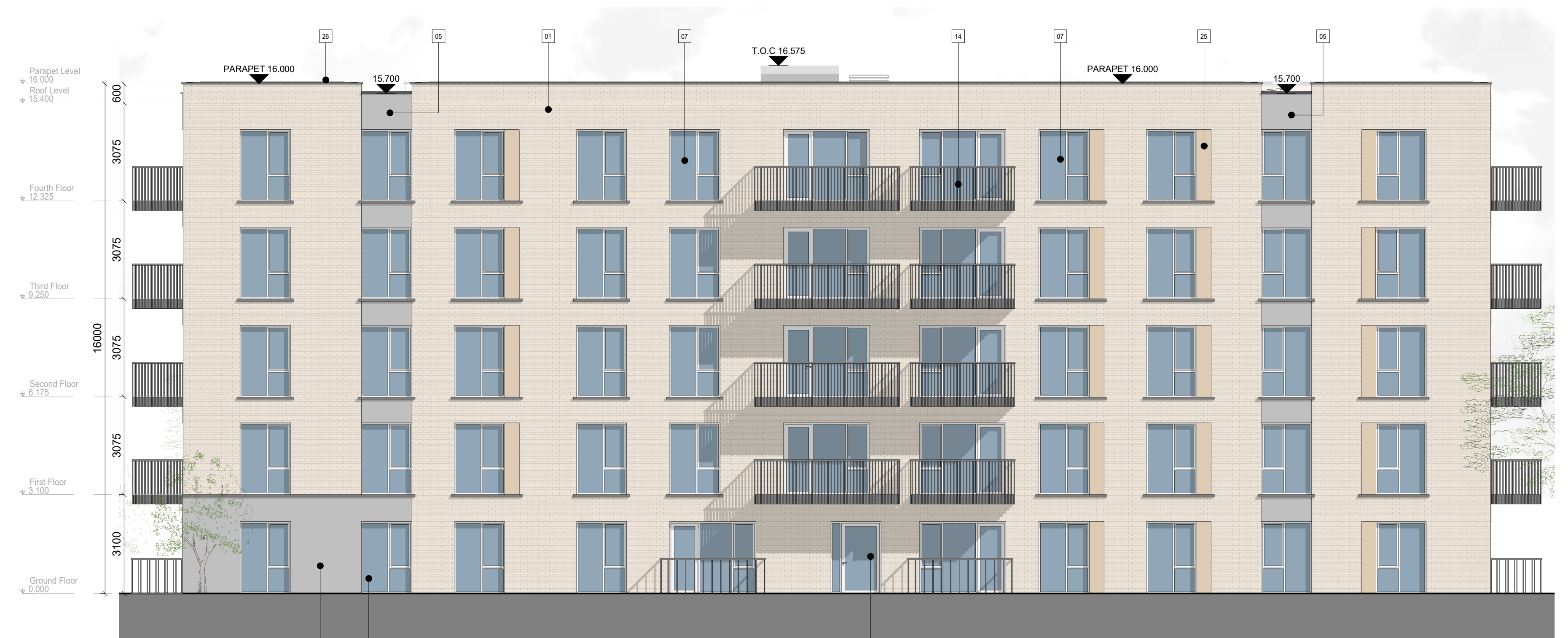
East Elevation SCALE: 1 : 100