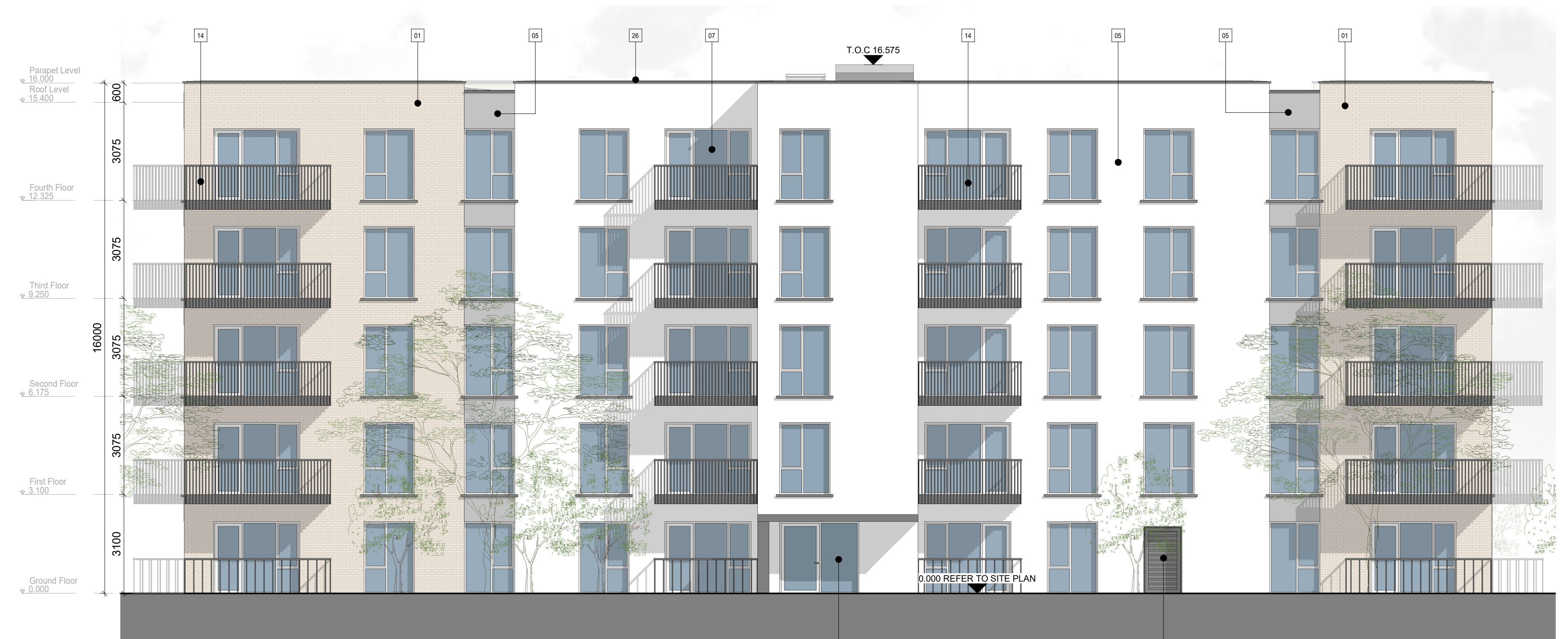
West Elevation SCALE: 1 : 100